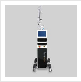
Hospital CO2 Fractional Laser