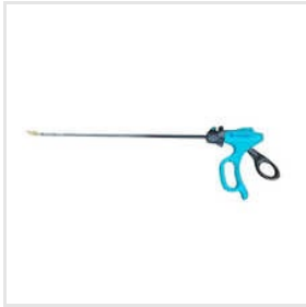
Vessel Sealer Cutter