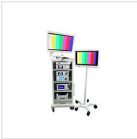
Stryker 1588 Aim HD Camera System