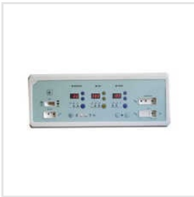
300W Surgical Cautery Machine