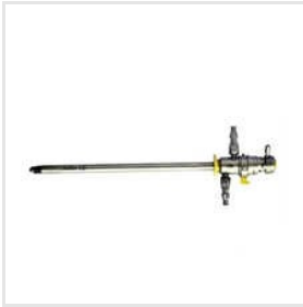
Bi Polar Resectoscope Sheath