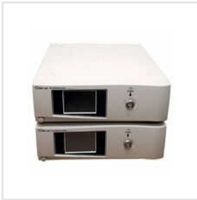
Stryker 1288 HD Camera System