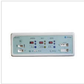
Electrosurgical Cautery Machine