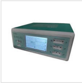
Vessel Sealer With Cutter