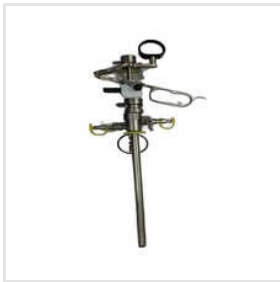
Bipolar Resectoscope Set