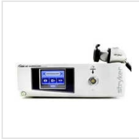
Stryker Endoscopy Camera