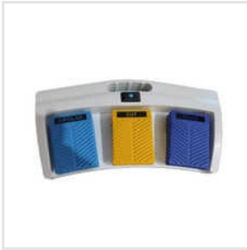
Vessel Sealer With Cutting Bipolar