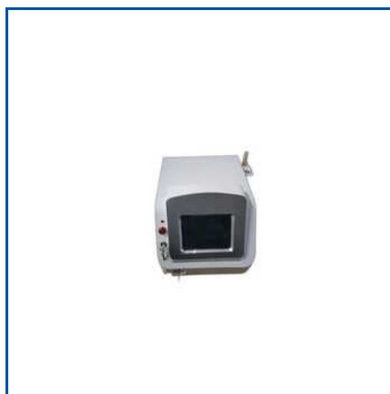
DIODE LASER MACHINE