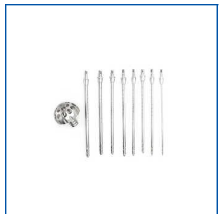
TRANSFORAMINAL ENDOSCOPIC BONE DRILL