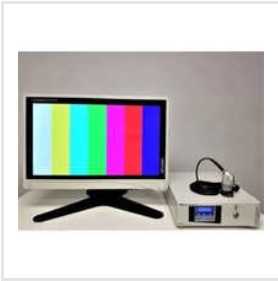
Stryker 1488 Camera System