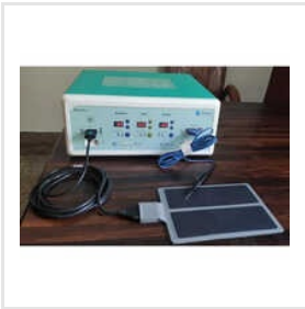
Electrosurgical Cautery Unit